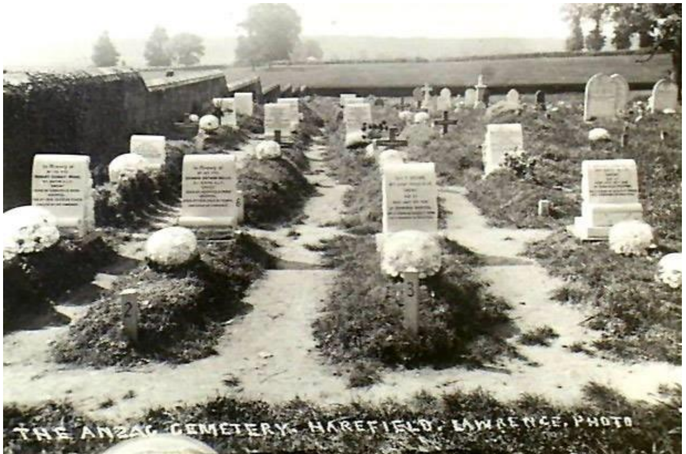
St. Mary the Virgin Churchyard, Harefield, Middlesex, England c. 1918.

The Australian corner of Harefield churchyard, containing the graves of 111 AIF personnel and one nursing sister who died of wounds or illness at No. 1 Australian Auxiliary Hospital, Harefield Park. The graves have rectangular headstones with carved scrolls at top and bottom and all bear the words "Erected by his comrades" and "ANZAC".