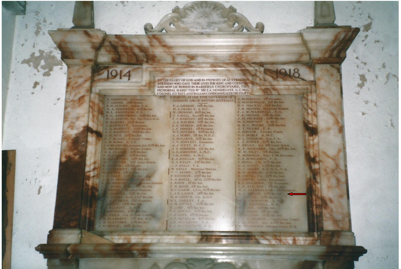
Australian Soldiers' Memorial, Harefield