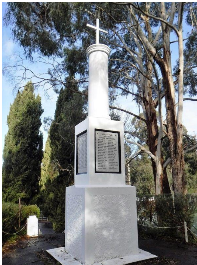
Aldgate War Memorial