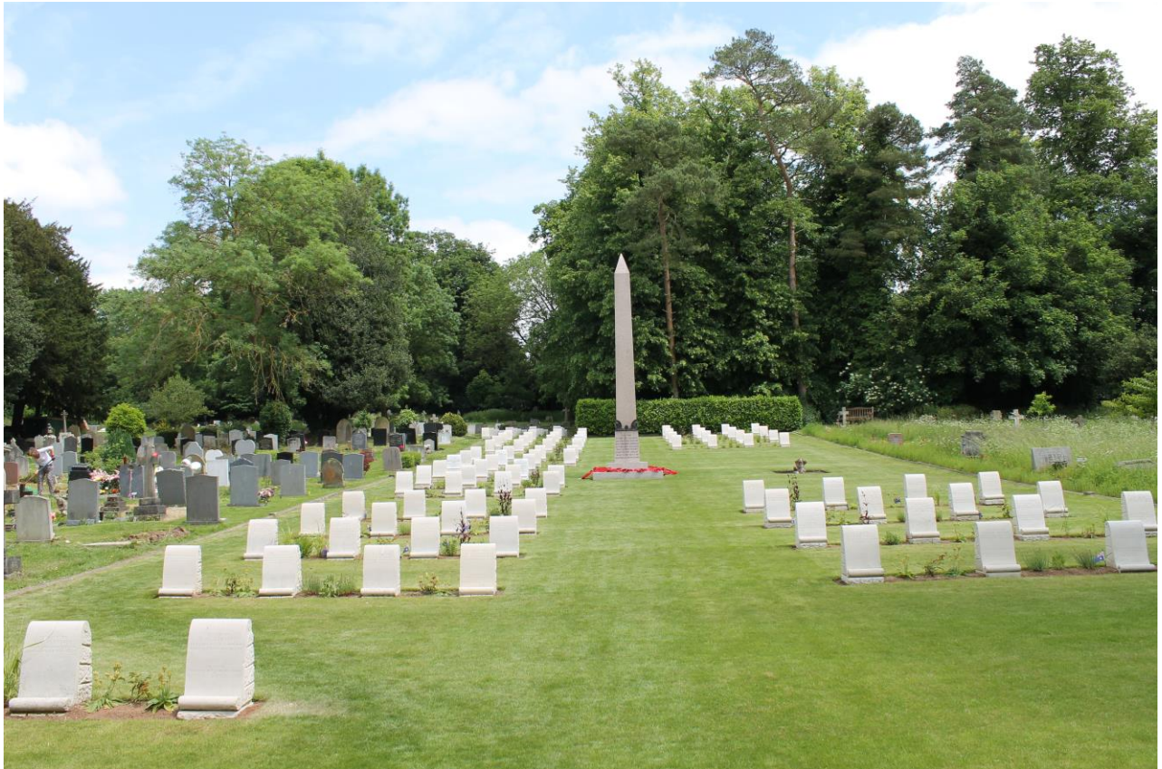
St. Mary the Virgin Churchyard, Harefield