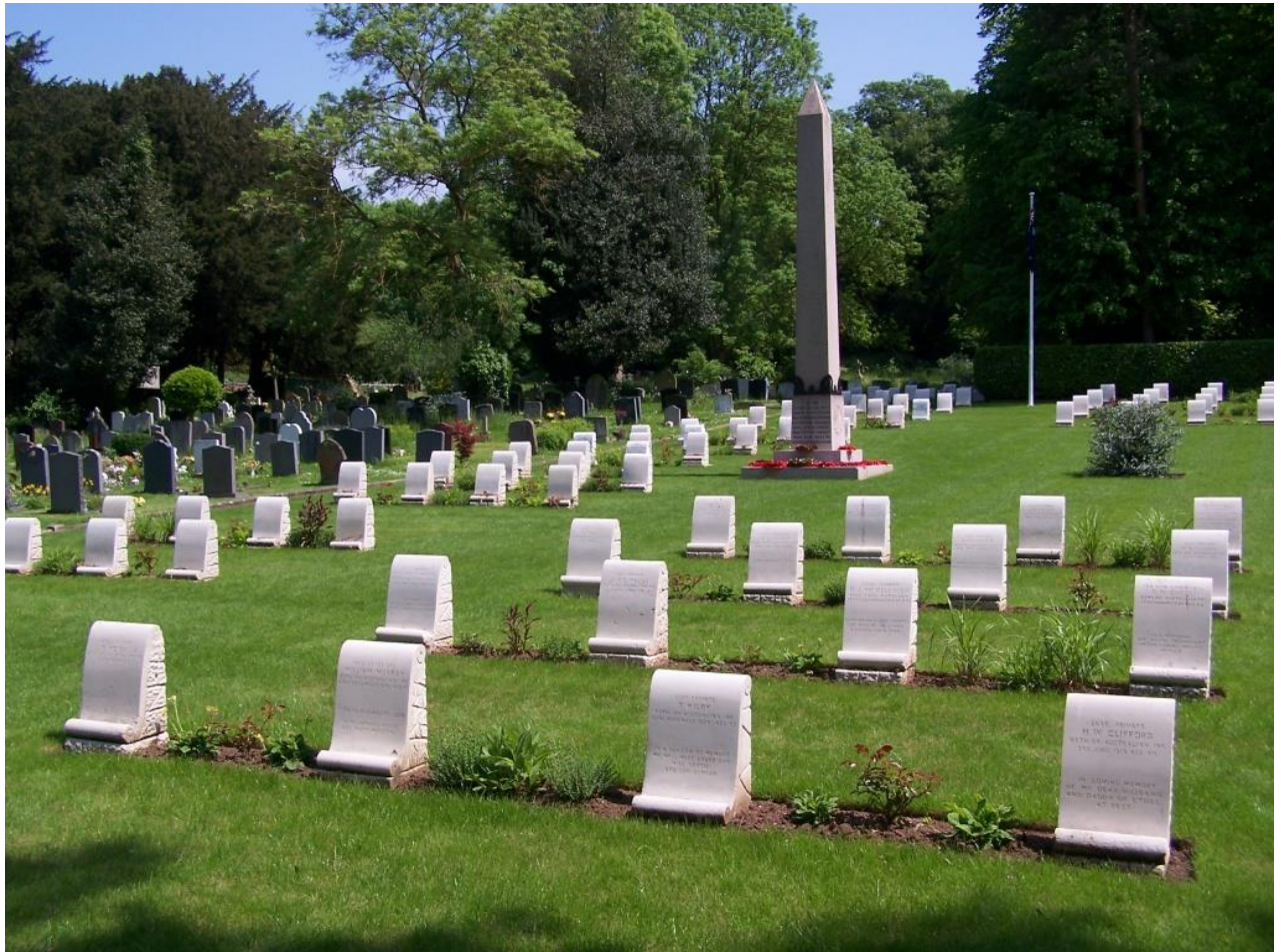
St. Mary the Virgin Churchyard, Harefield